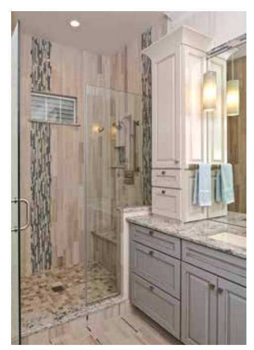
HAYMARKET HAVEN cont. from 7

The kitchen was designed for low maintenance, with quartz solid surfaces and porcelain tile on the backsplash. Light-colored cabinets on the perimeter